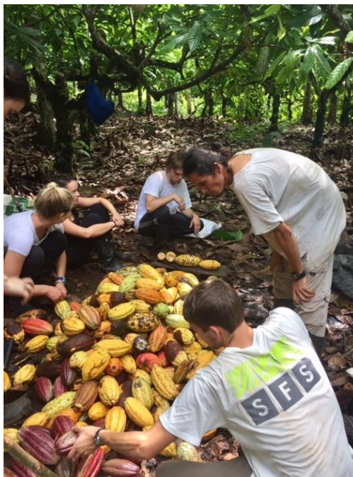
SFS students harvesting cacao at La Iguana Chocolate Farm