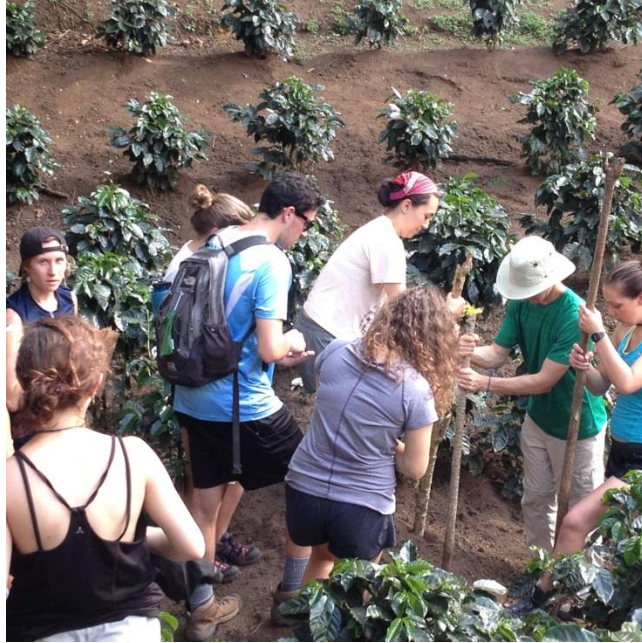
SFS students intercropping beans with coffee at LIFE Monteverde Farm