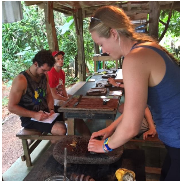
SFS students grinding cacao on an indigenous metate at La Iguana Chocolate Farm

Participation – Since we offer a program that is likely more intensive than you might be used to at your home institution, missing even one lecture can have a proportionally greater effect on your final grade simply because there is little room to make up for lost time. Participation in all components of the course is mandatory, it is important that you are prompt for all activities, bring the necessary equipment for field exercises and class activities, and simply get involved.